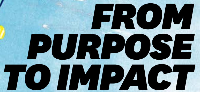
Figure out your passion and put it to work.